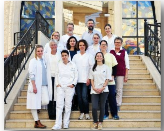
The German Medical Team.

During October and November, we were able to provide over 4,000 health care consultations. We also provided most of the people who attended our medical clinics with needed medication. Several of these patients have benefited from monthly follow-up and treatment for chronic conditions. Over twenty patients received hospital care, some which were life-saving interventions. Medical consultations were held at the Church premises and at the community centers serving people living within the surrounding camps. We thank all of our medical teams that were with us from different parts of the world: USA, Brazil, and Germany. Over 50 medical doctors and nurses with different specialties volunteered during those days.