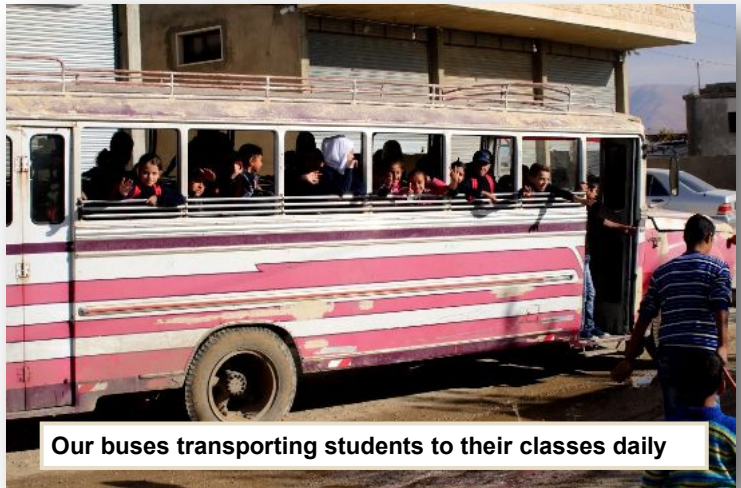
Our buses transporting students to their classes daily

The new 2017-2018 school year started with great enthusiasm as we welcomed back the 550 returning and new students, 1 st of October. The voices of the children singing during chapel time is echoing back into the many floors of our church building. The laughter and voices of children playing during break time has filled the air with a joyful atmosphere again. We currently have 570 children that come to our schools and are spread in three locations. Our in-house school at the Church premises hosts 280 children. The Fayda Community Center hosts 120 children and the Ablah Center enrolls about 170 children. We are also very happy to have