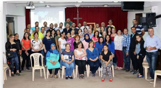
Our team of volunteers and full time workers during the one day retreat